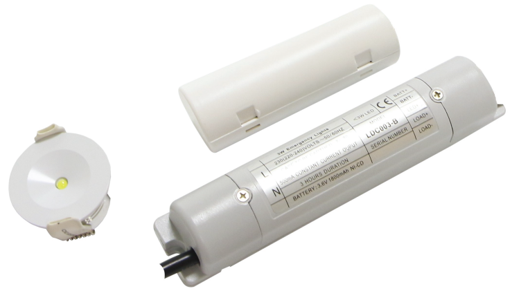
Image above shows module, battery and white lamp head Image below shows black & silver bezel options