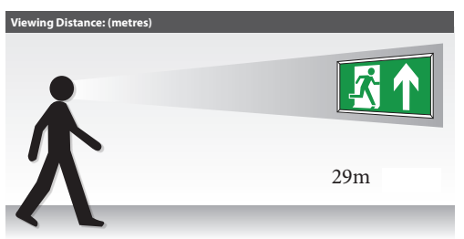
Note: Image not to scale and for pictorial reference only