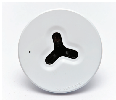
Optical Fire Detector

A combination of Infra-Red LEDs and photo-diodes identify smoke particles detected just below the detector housing and initiates an alarm.