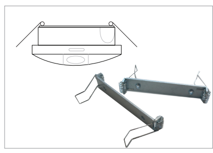
The semi - recessing kit for the Meteor LED includes retaining spring clips that fit securely to the luminaire. This allows the Meteor LED to become a semi - recessable fitting to the ceiling or wall.