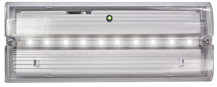
E/ME/M3/LED/IP65 - Meteor - LED IP65