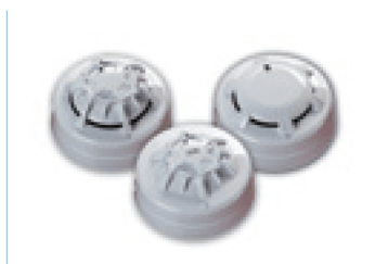
Up to 20 fire/heat detectors per zone