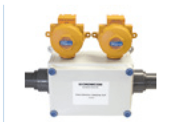
Fan control for Crowcon's Environmental Sampling Unit