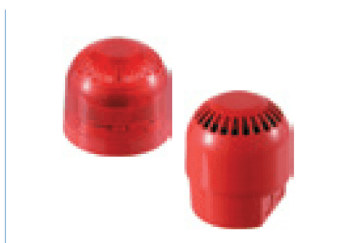
Sounders and Beacons Safe area, intrinsically safe or flameproof options