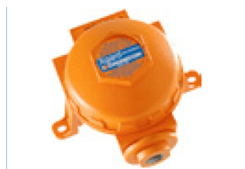
Industry-standard gas detectors