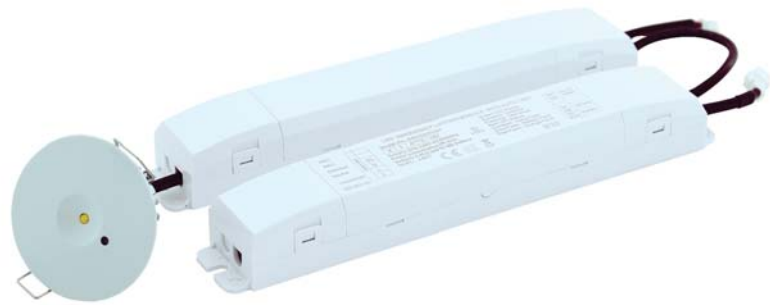
Image shows module, battery and lamp head