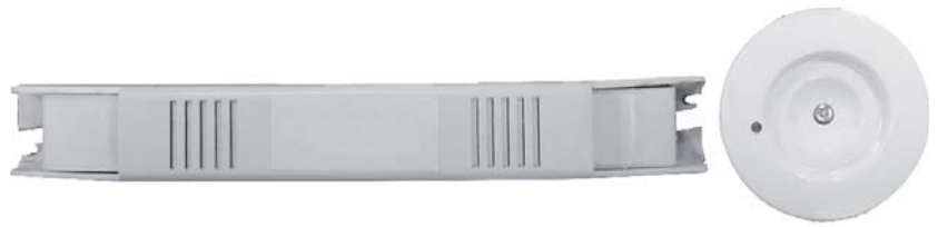
Image shows module and lamp head