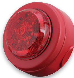
General LED beacon