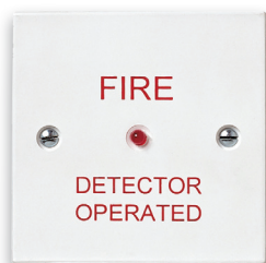
Remote detector indicator