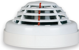
Fixed heat detector