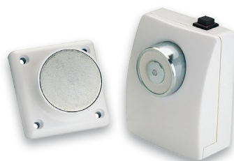
Magnetic door release

The Veritas 2 range includes a suite of expertly developed accessories which work in perfect harmony for a professional end result.