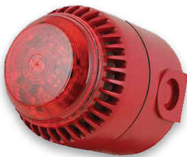
General sounder & LED beacon