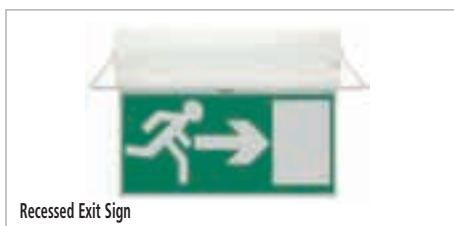
Recessed Exit Sign