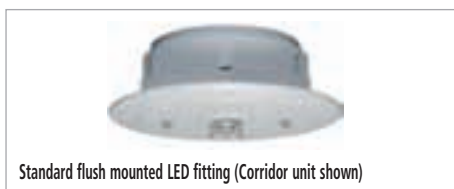
Standard flush mounted LED fitting (Corridor unit shown)