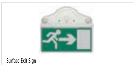
Surface Exit Sign