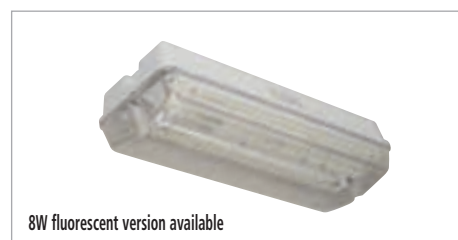
8W fluorescent version available