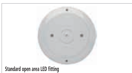
Standard open area LED fitting