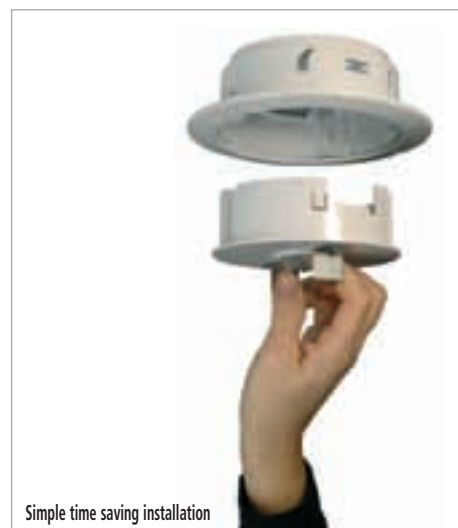
Simple time saving installation