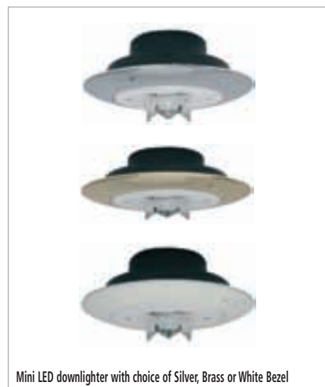
Mini LED downlighter with choice of Silver, Brass or White Bezel