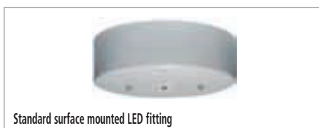
Standard surface mounted LED fitting